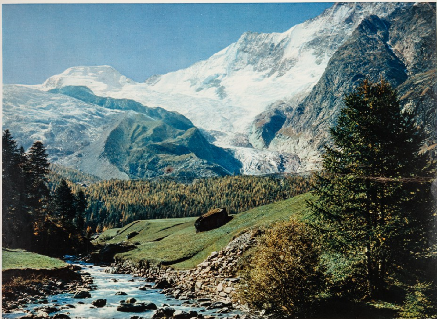
The Alphubel and Täschhorn, Saas-Fee (Swiss Alps)