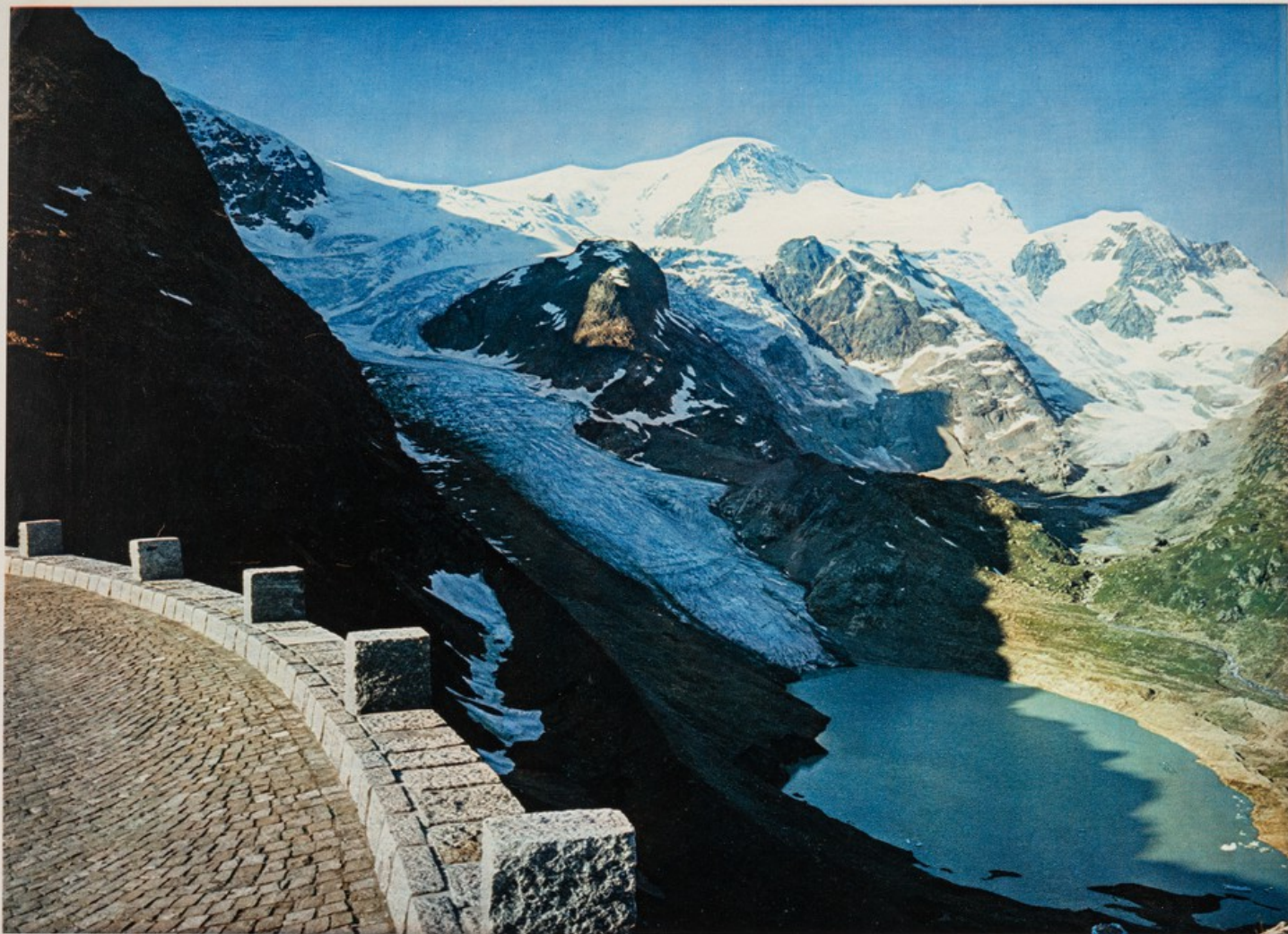
The Steinglacier from the Susten Pass (Swiss Alps)