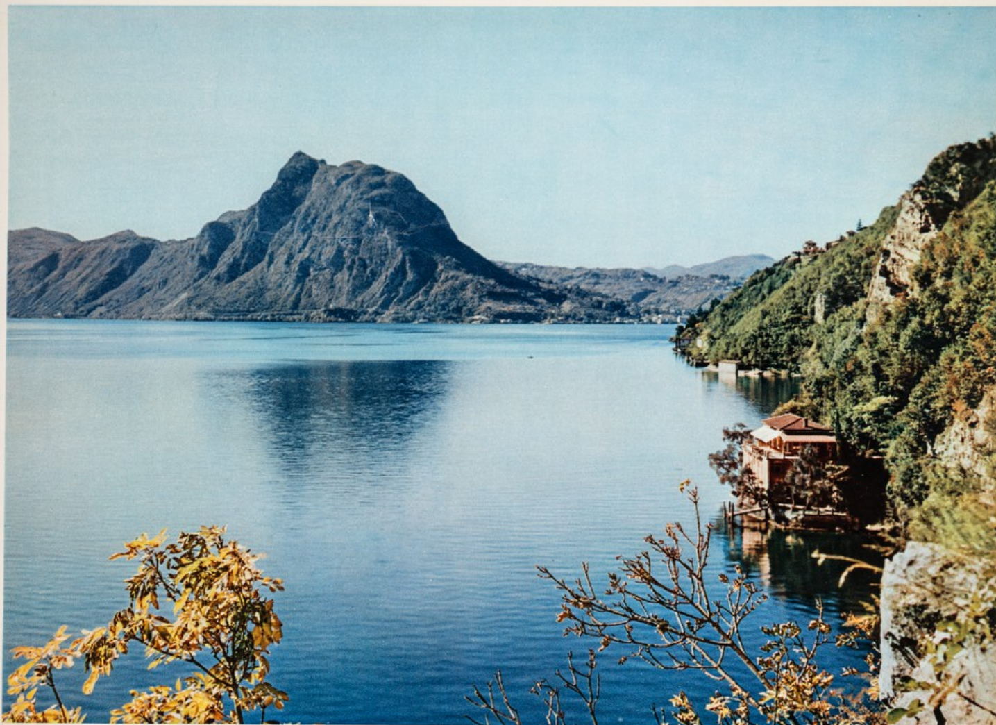
Lake of Lugano and San Salvatore (Switzerland)