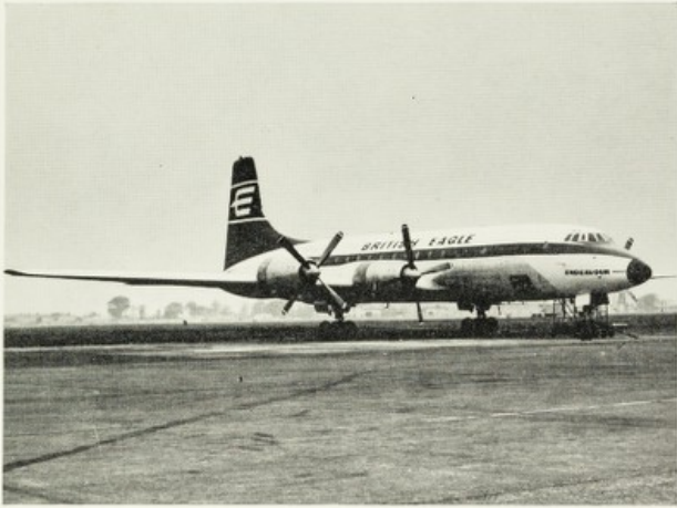
No. 3 in a series Britannia 1952