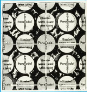
Each tablet of Paracodol contains Paracetamol BP 500 mg and Codeine Phosphate BP 8 mg in an effervescent base