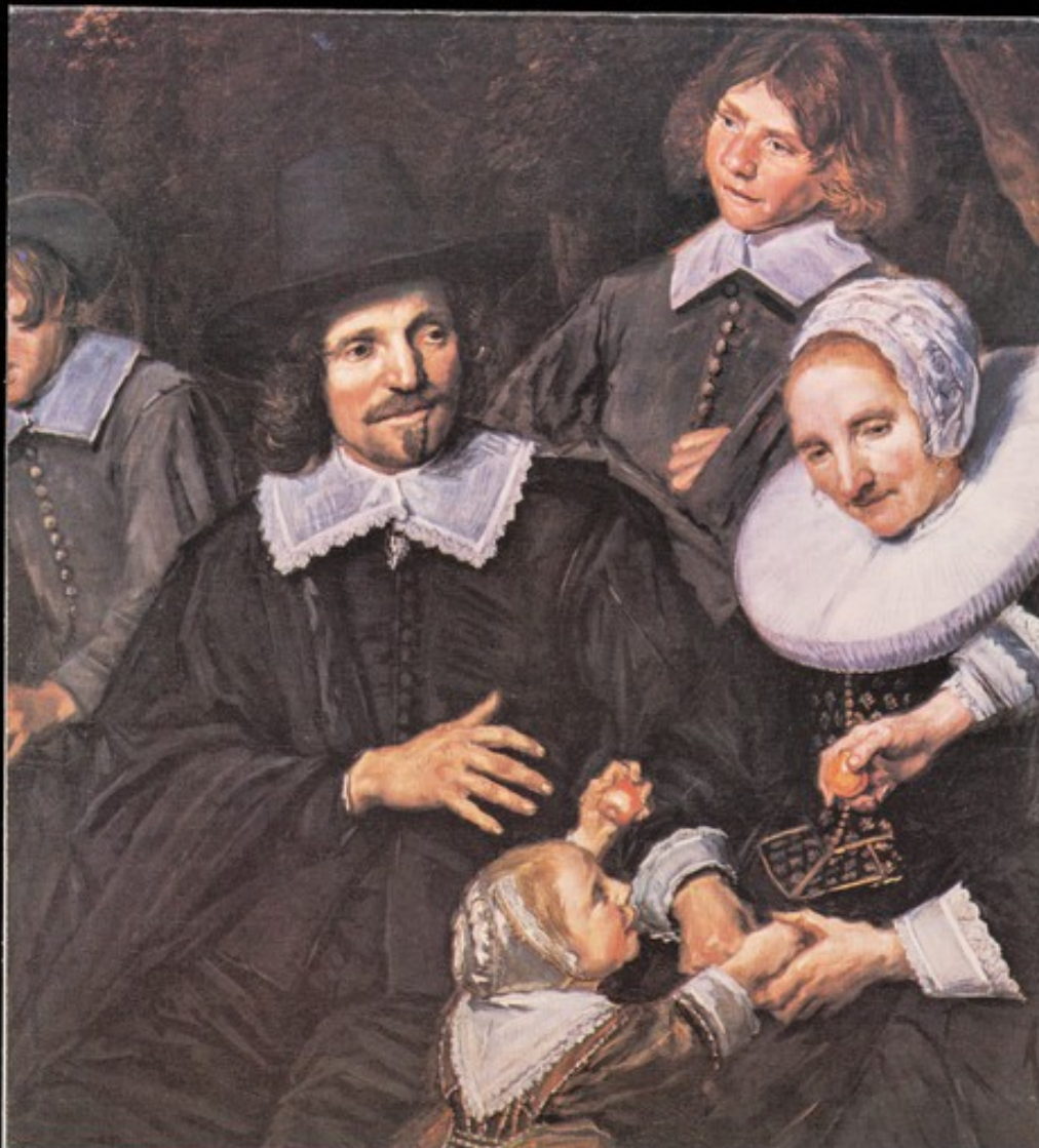
A party of young men and women Hals (c. 1580 (?) - 1666)