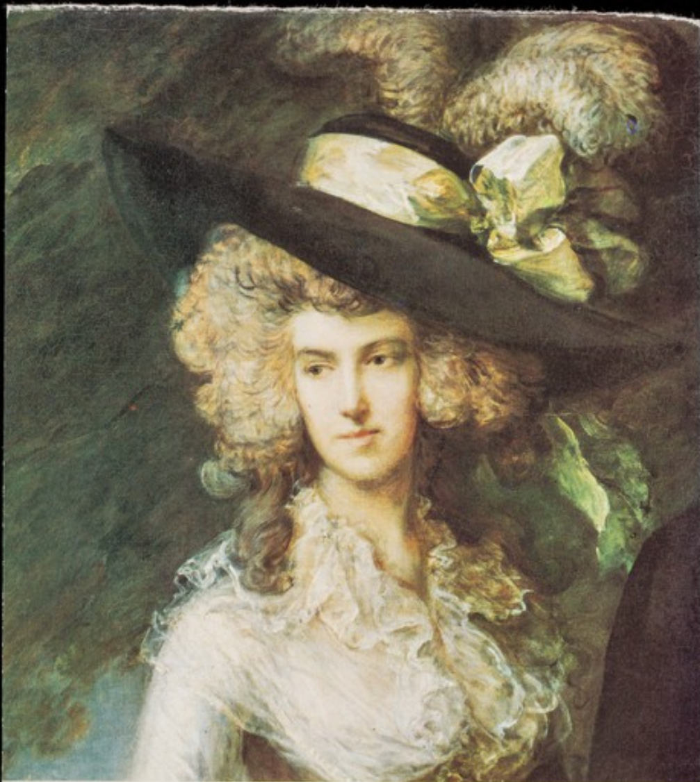
"The Morning Walk" (detail) Gainsborough (1727-1788)