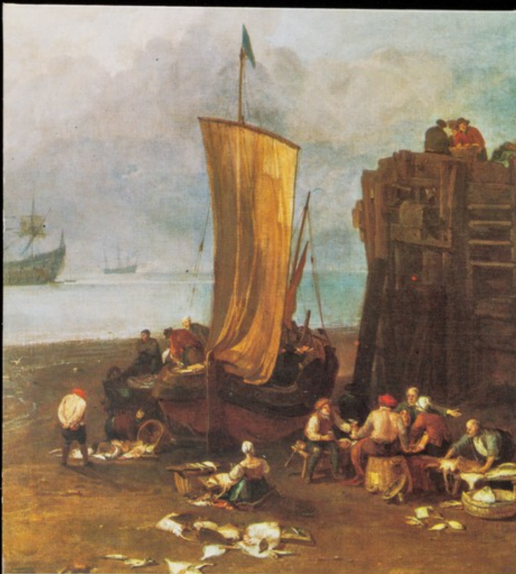
Sun rising through Vapour: Fishermen cleaning and selling Fish (detail) Turner (1775-1851)