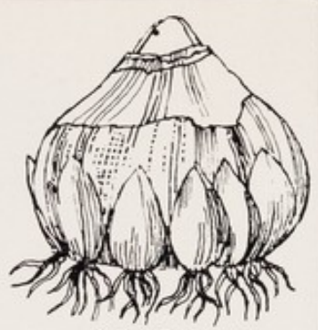
Star of Bethlehem