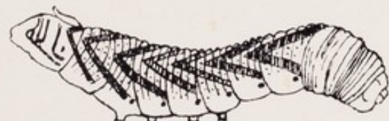
Death's Head Moth