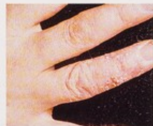
Irritant Contact Dermatitis