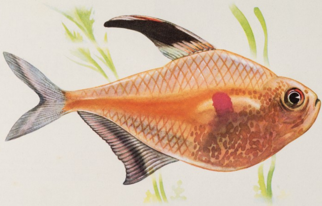
Bleeding Heart Tetra ( Hyphessobrycon callistus rubrastigma ) x 3