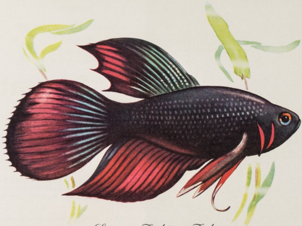
Siamese Fighting Fish