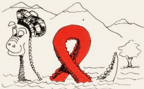
ALASTAIR PRINGLE THE EXCHANGE