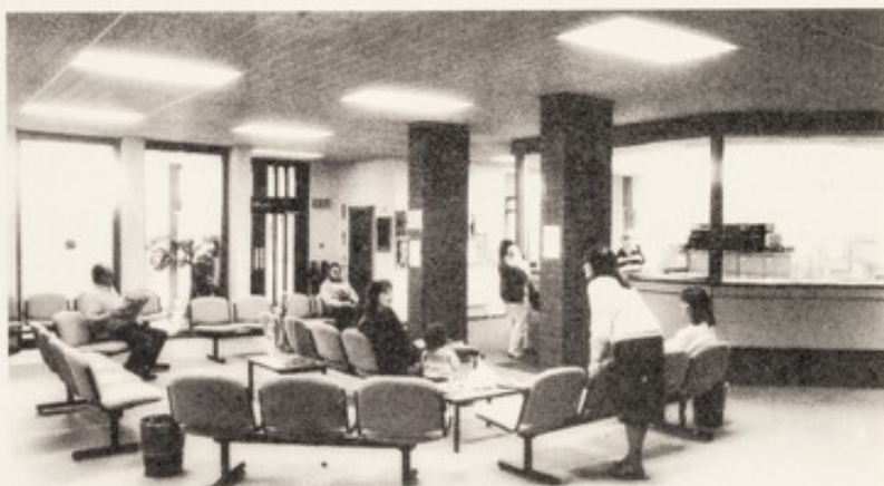
Craigroyston Health Clinic

£100,000 extra for dialysis services at the Royal Infirmary and Western General Hospital.