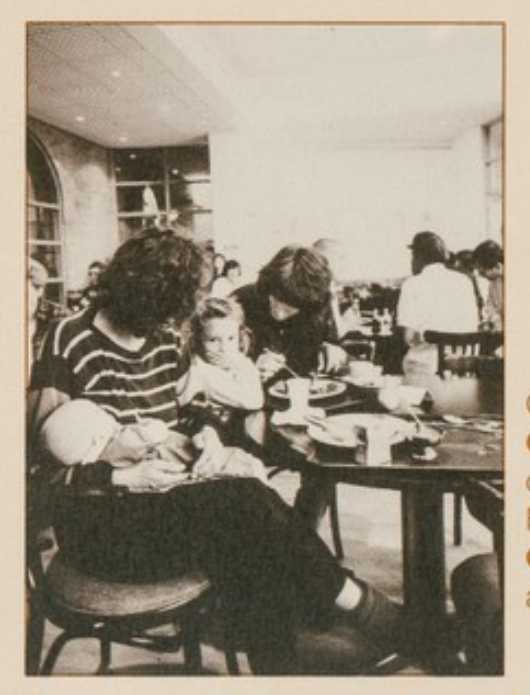
Café opening times: • 9am to 7.30pm on Mondays to Fridays • 12pm to 3.30pm at weekends

If any of these rules are broken, a part or total ban on use of the centre may be imposed. You may of course appeal against any decision which you feel is unfair.