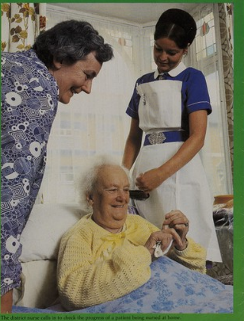
The district nurse calls in to check the progress of a patient being nursed at home.

The domiciliary midwife This aspect of her work is just as important as the other parts. She explains that she often visits patients in their homes, providing care and support. She also discusses the challenges of working in a domiciliary setting and the need for good communication and teamwork.