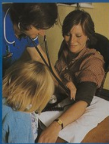
Antenatal care by the district midwife.