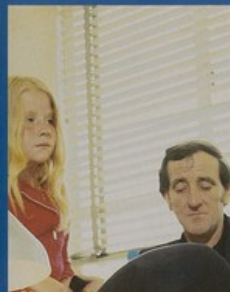
District nurse at a health centre surgery.