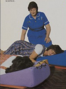
The midwife calls to see a family.