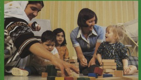
The health visitor gains the confidence of mothers and young children in a playgroup.