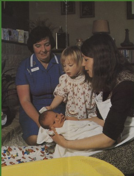
A young mother receives advice on postnatal care from the district nurse.

The length of the course for State Registered Nurses is one year. Opportunities for State Enrolled Nurses are limited. The course is 18 months. The minimum entry age is 20. Other applicants for direct entry must have five GCE 'O' levels (grade A, B or C) or the equivalent, one of which should be English or Welsh Language and one mathematics or a science.