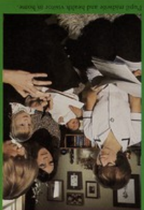
Health visitor groups with a handicapped child

A district nurse explains her work in the home. She says that the most important part of the job is helping the patient and their family. She also talks about the importance of working with other health professionals and the need for a good team approach.