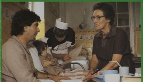
Hospital liaison is an important aspect of the health visitor's work.