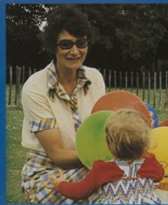
Getting to know children at a nursery school, part of the work of health visitors.