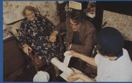
The general practitioner and the district nurse work together based on a home visit.