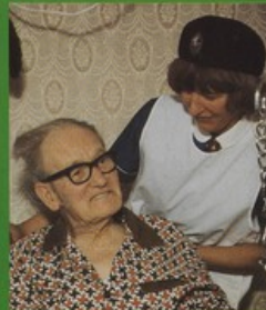
Comfort and care from the district nurse.