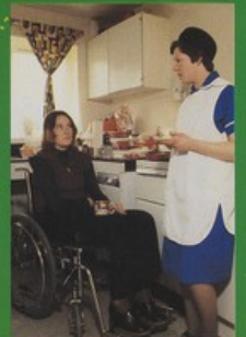
The district nurse talks over problems.