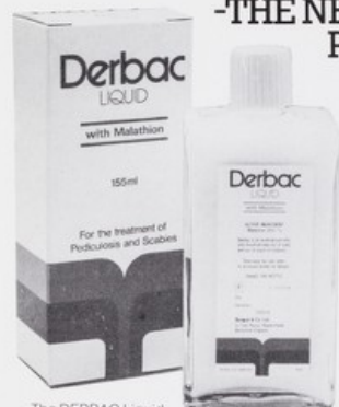
The DERBAC Liquid with Malathion new family pack - for the family head.