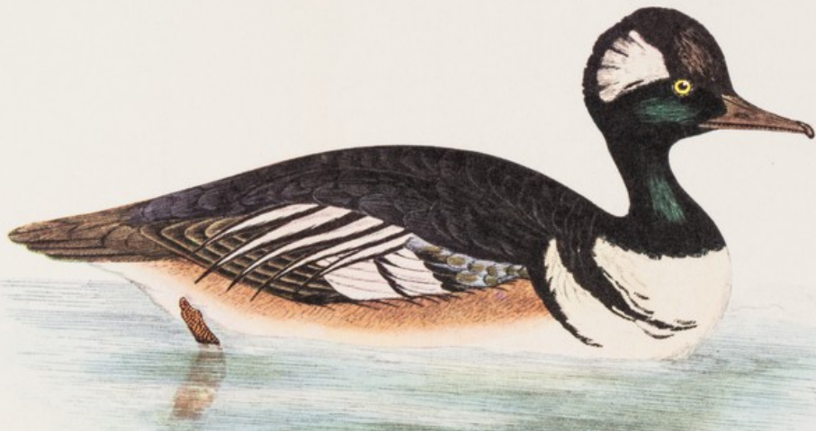
HOODED - MERGANSER.