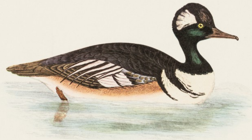
HOODED - MERGANSER.