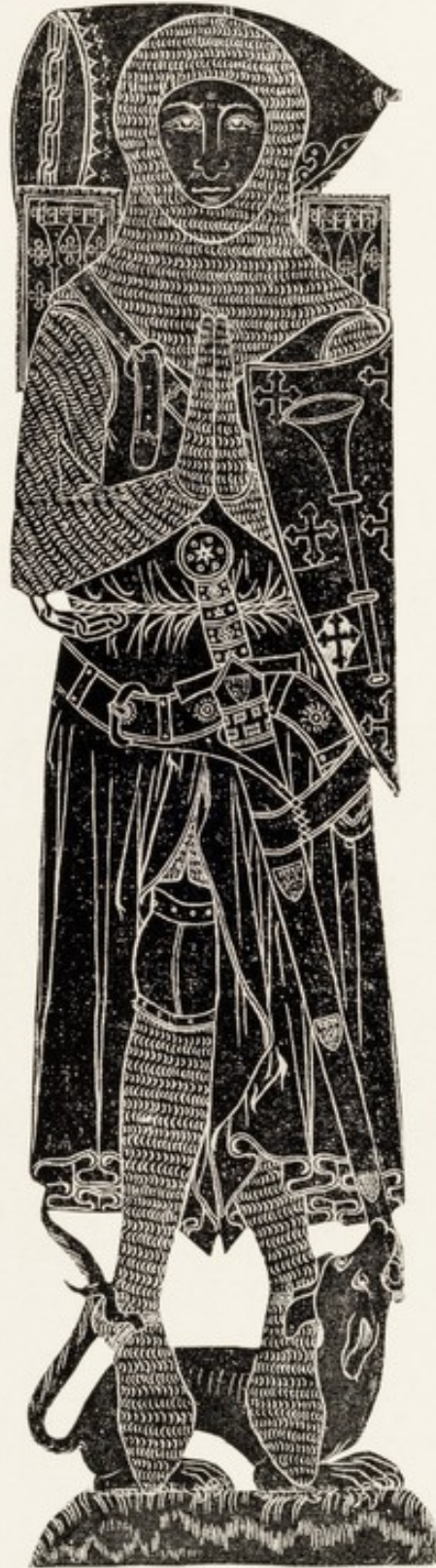
Sir Roger de Trumpington. Taken from The Church of St. Mary and St. Michael, Trumpington, Cambs. Circa 1289.