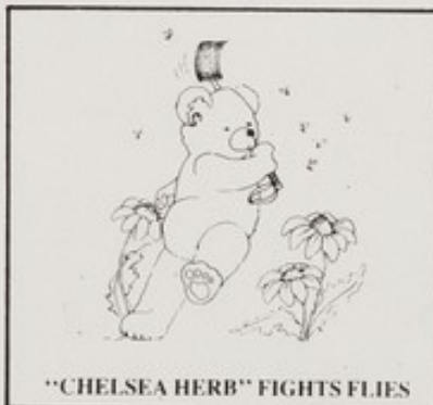
19 BUZZ OFF BEAR