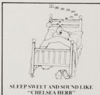
20 SWEET SLEEPING BEAR