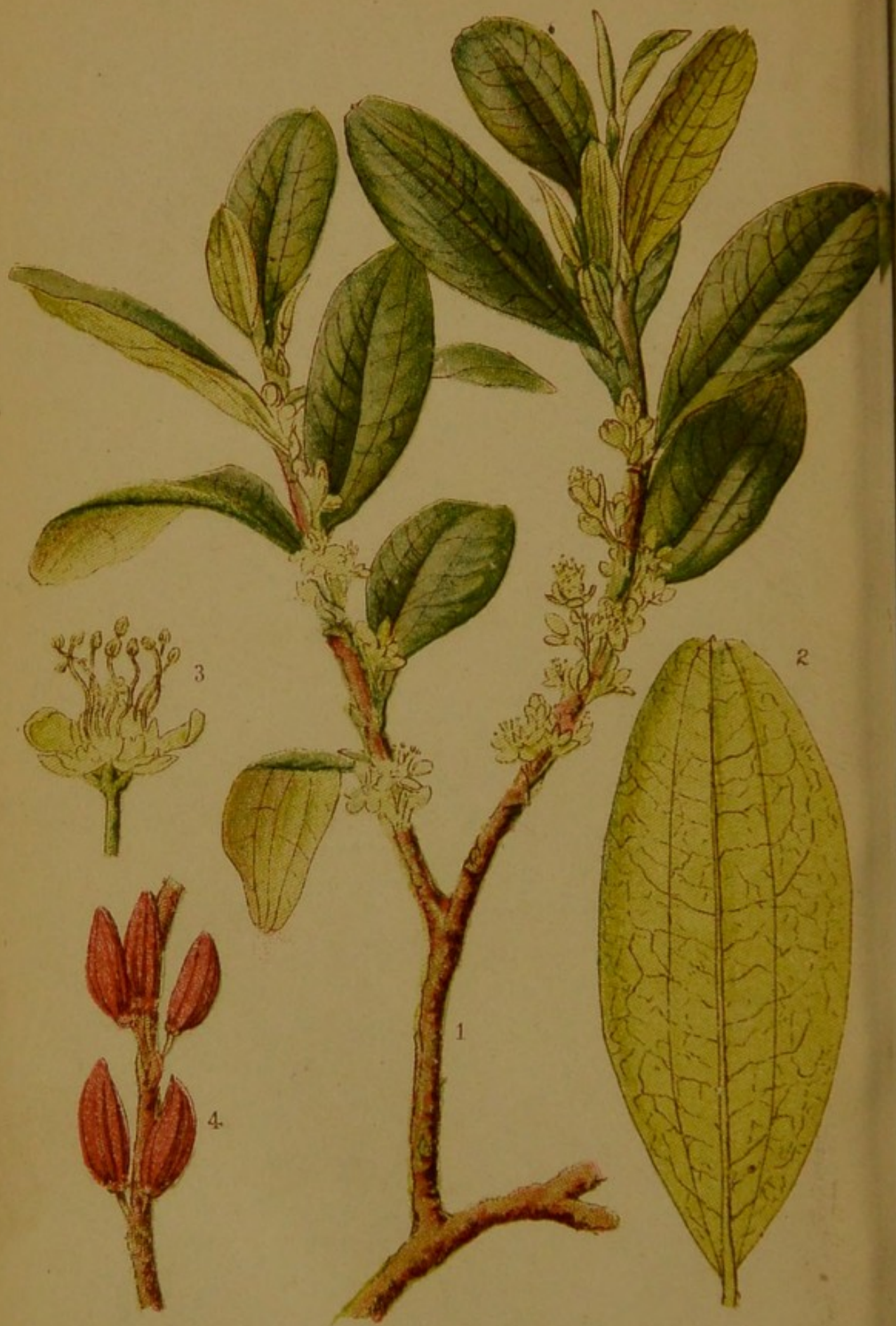
1. ERYTHROXYLON COCA 2. BACK OF LEAF (Full size) 3. FLOWER (enlarged.) 4. FRUIT.