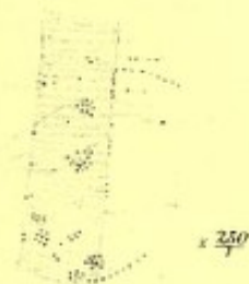
Isolated muscle-fibre of horn 1, with sporules & bacilli on its surface.