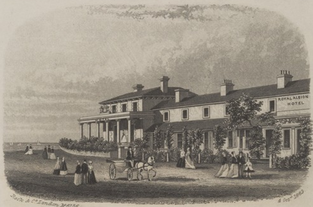
Royal Albion Hotel. Freshwater Gate. Isle of Wight.