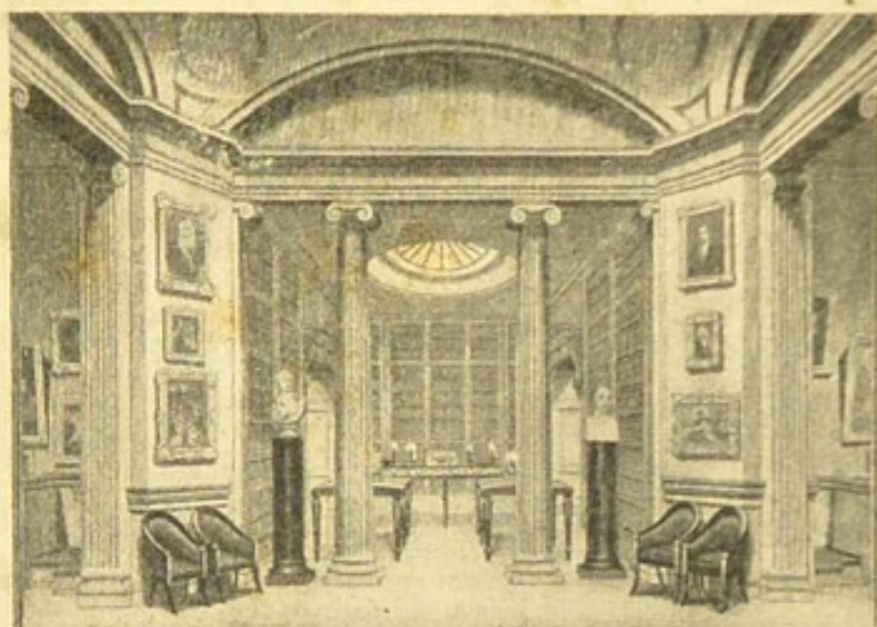
BIBLIOTHECA HUNTERIANA GLASGUENSIS