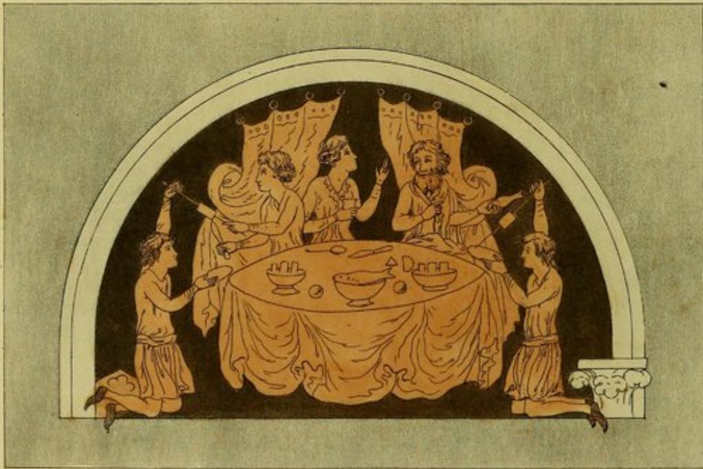
A Saxon Entertainment.

From Strutt's hoyda Anſel-cynnan . Vol.1.Pl:16.Fig:1.