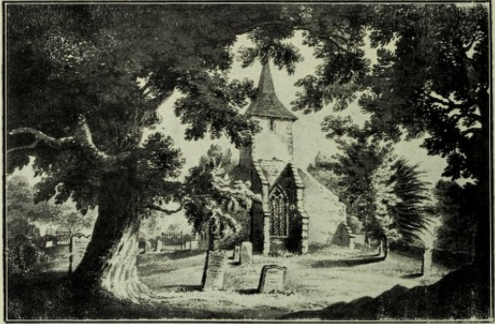
SANDERSTEAD CHURCH, circa 1770.