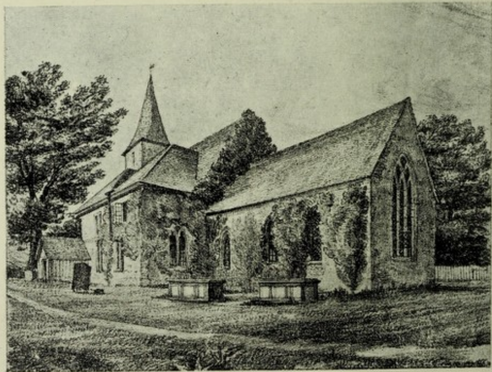
SANDERSTEAD CHURCH, circa 1824.