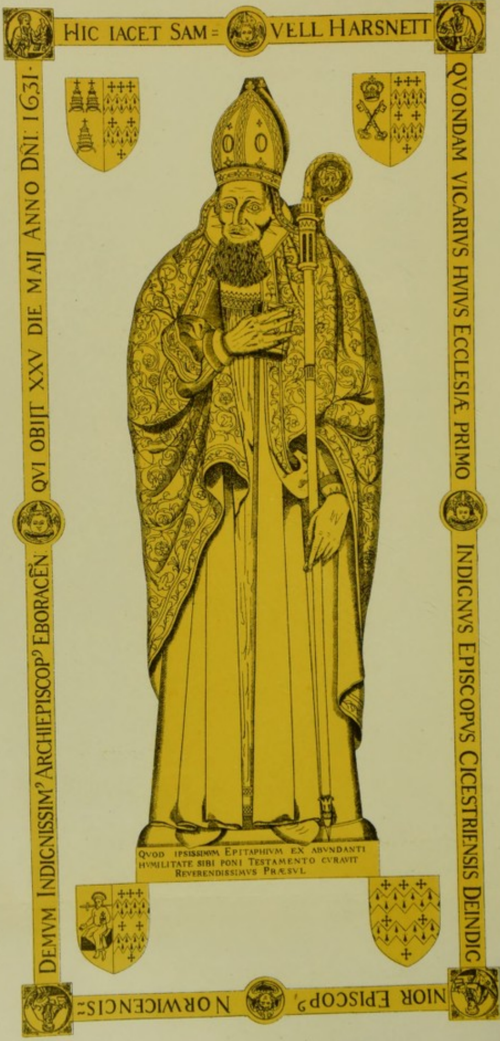
BRASS OF ARCHBISHOP HARSNETT, IN CHIGWELL CHURCH, ESSEX.