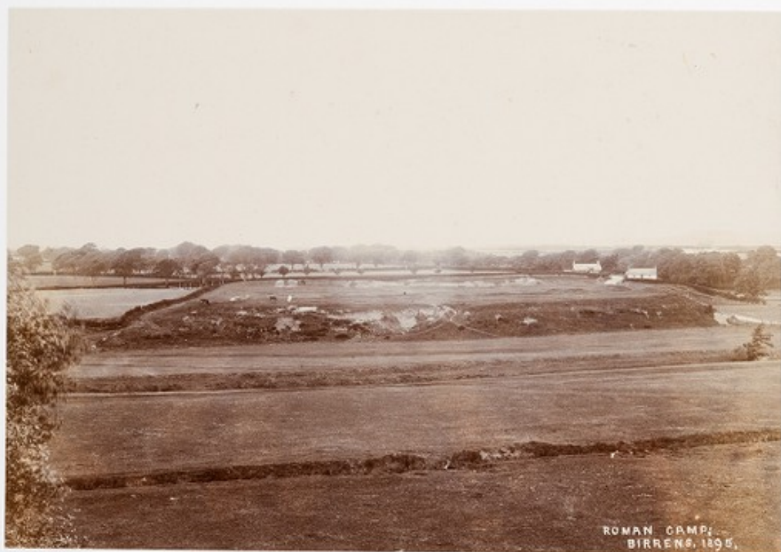
ROMAN CAMP, BIRRENS, 1895.