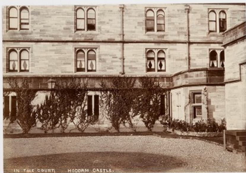
IN THE COURT, HODORN CASTLE.