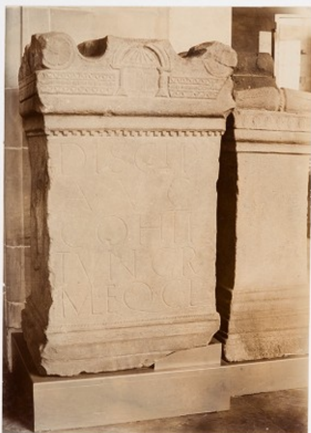
Altar found in the well at "Litreus" 1895