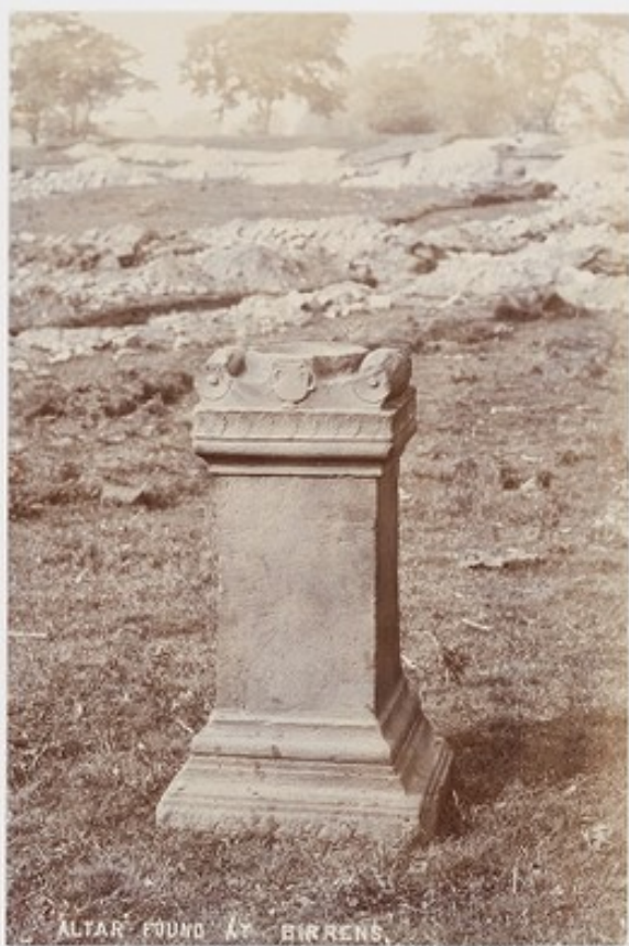
ALTAR FOUND BY BIRRENS