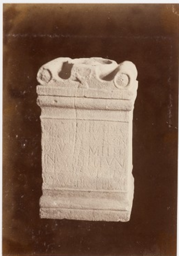
At Hoddam Castle