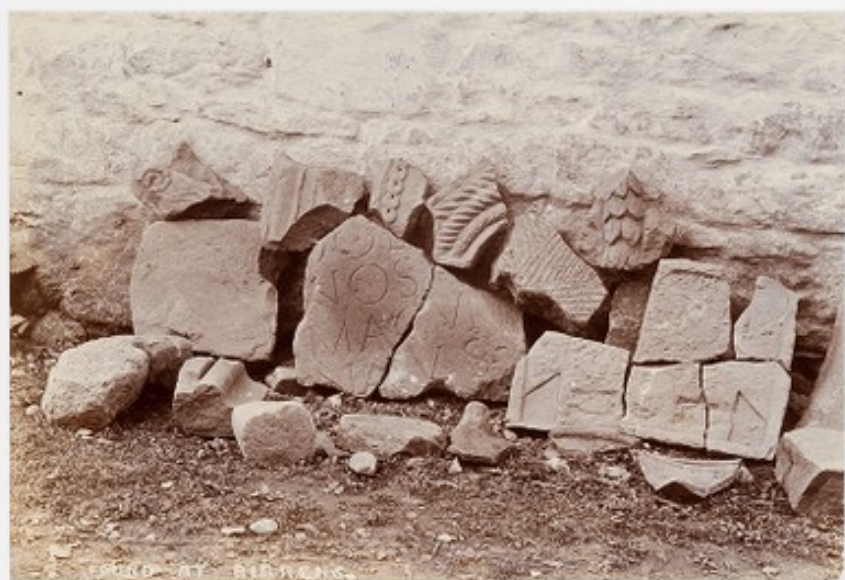
STONE AT BIRKENES