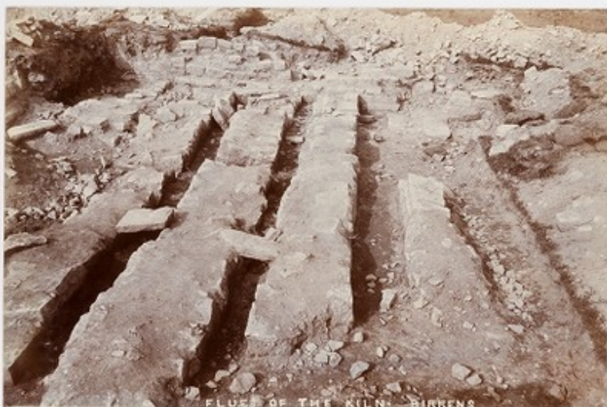
FLUES OF THE KILN: BIRKENS