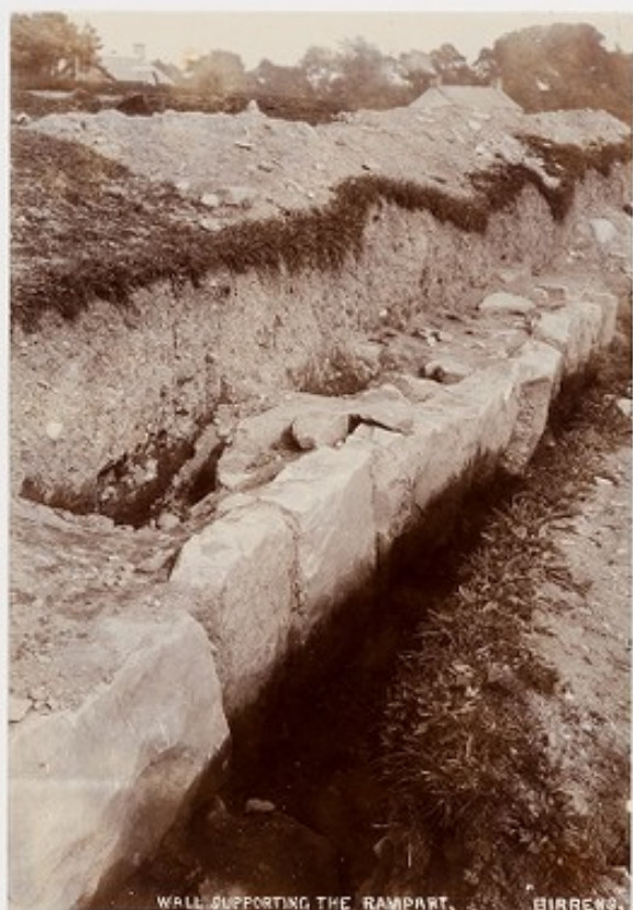
WALL SUPPORTING THE RAMPART. BIRREWS.