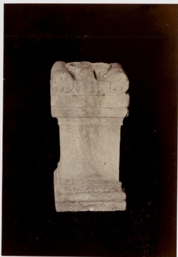
At Hoddam Castle