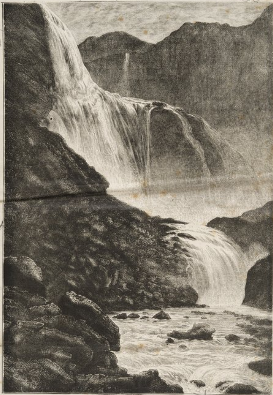
ILLUSTRATIONS OF THE CIVIL PSALM. VERSES 6-8.

in Bedroom he used to give the patient Jalapa for their waterings and they would not have done you any