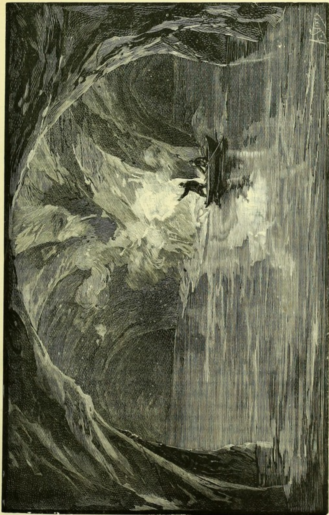
UNDERGROUND RIVER AT MARBLE ARCH, IRELAND.

less extended than those of Marble Arch, and of which every hole and corner was known for a long while. The whole ends in a wide gallery 300 feet long,