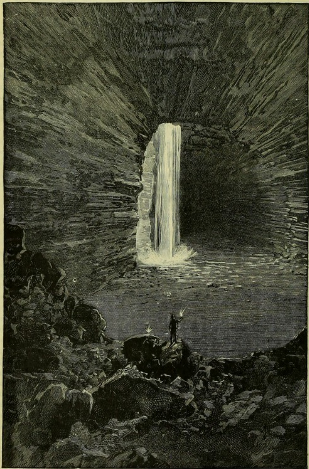
THE INTERIOR OF GAPING GHYLL, IN YORKSHIRE.

Beagh disappears near Gort, nor for real abysses (pot-holes or pipes) like Noon's hole (see above).