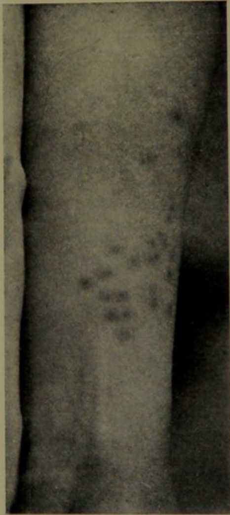
Arm of A. M. 40 hours after 30 specimens of Ceratophyllus fasciatus had been placed upon it, one at a time. 24 of these were seen to bite.