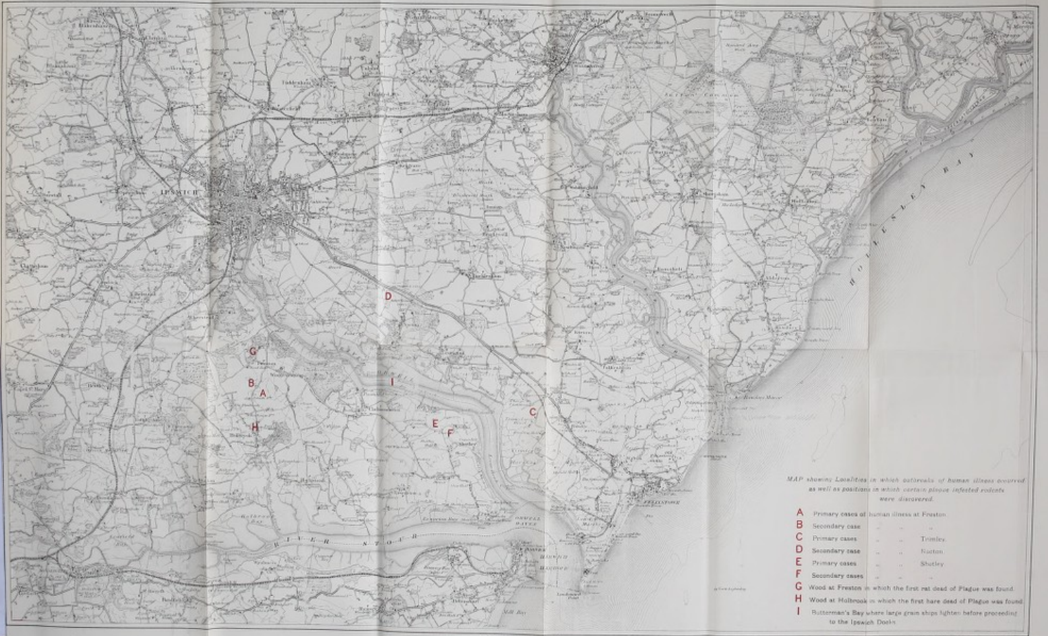
MAP showing Localities in which outbreaks of human illness occurred as well as positions in which certain plague infected rodents were discovered.