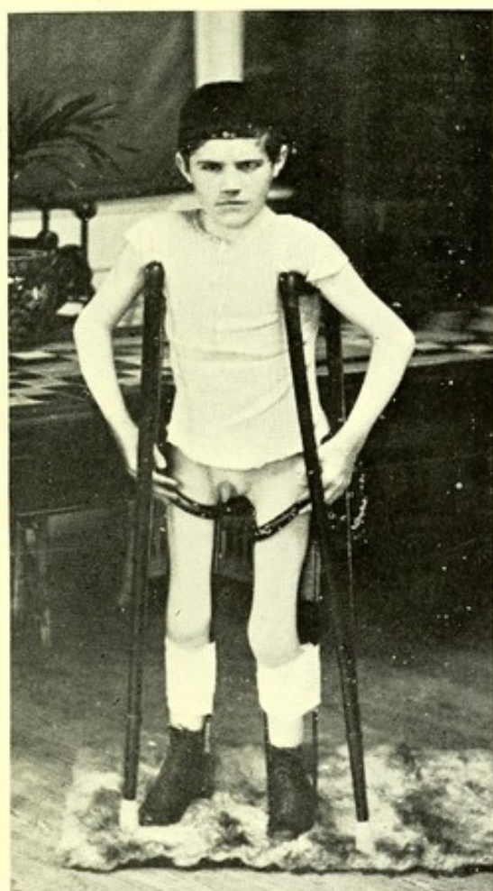
Fig. 3.—T. S. After arthrodesis of one knee and both ankles, and osteotomy of the knees.