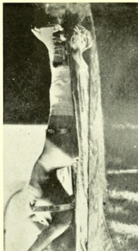
Fig. 6.—Same case undergoing treatment for lordosis.