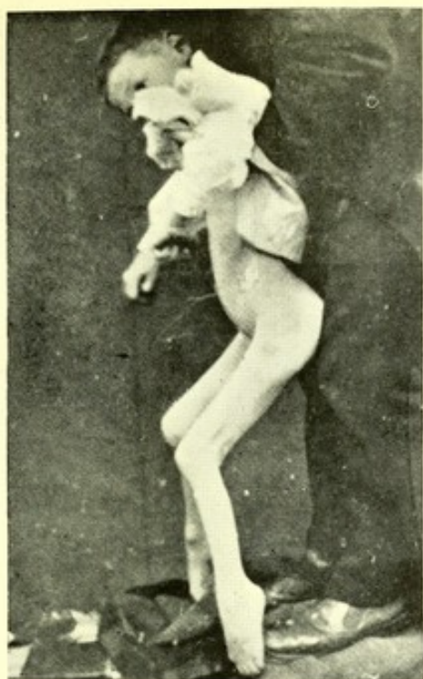
Fig. 5.—Fixed paralytic deformities. Marked lordosis, genu valgum, flexion of hips and knees, extension of ankles.