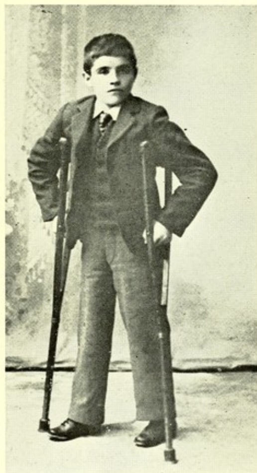
Fig. 4.—T. S. Some months later. He now walks with sticks.