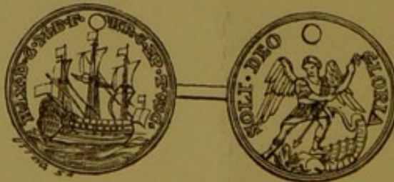
The Cardinal of York, as Henry IX.