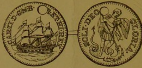
Charles II. (Gold.)