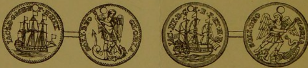
The Pretender, as James III.