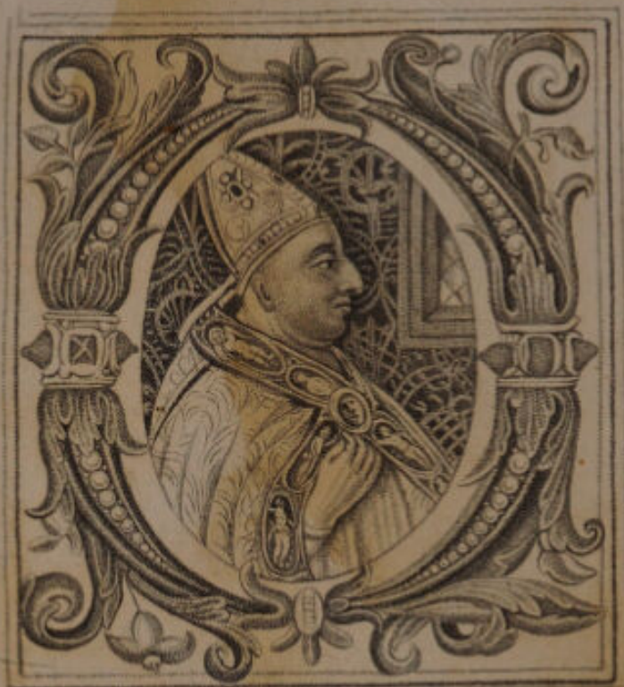
LEO X. PONT. MAX.