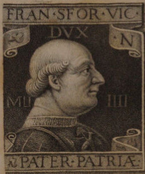
F. SFORZA MEDIOL. DUX.