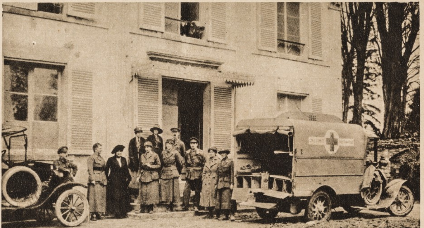
One of our Relief Stations with British Voluntary Lady Workers