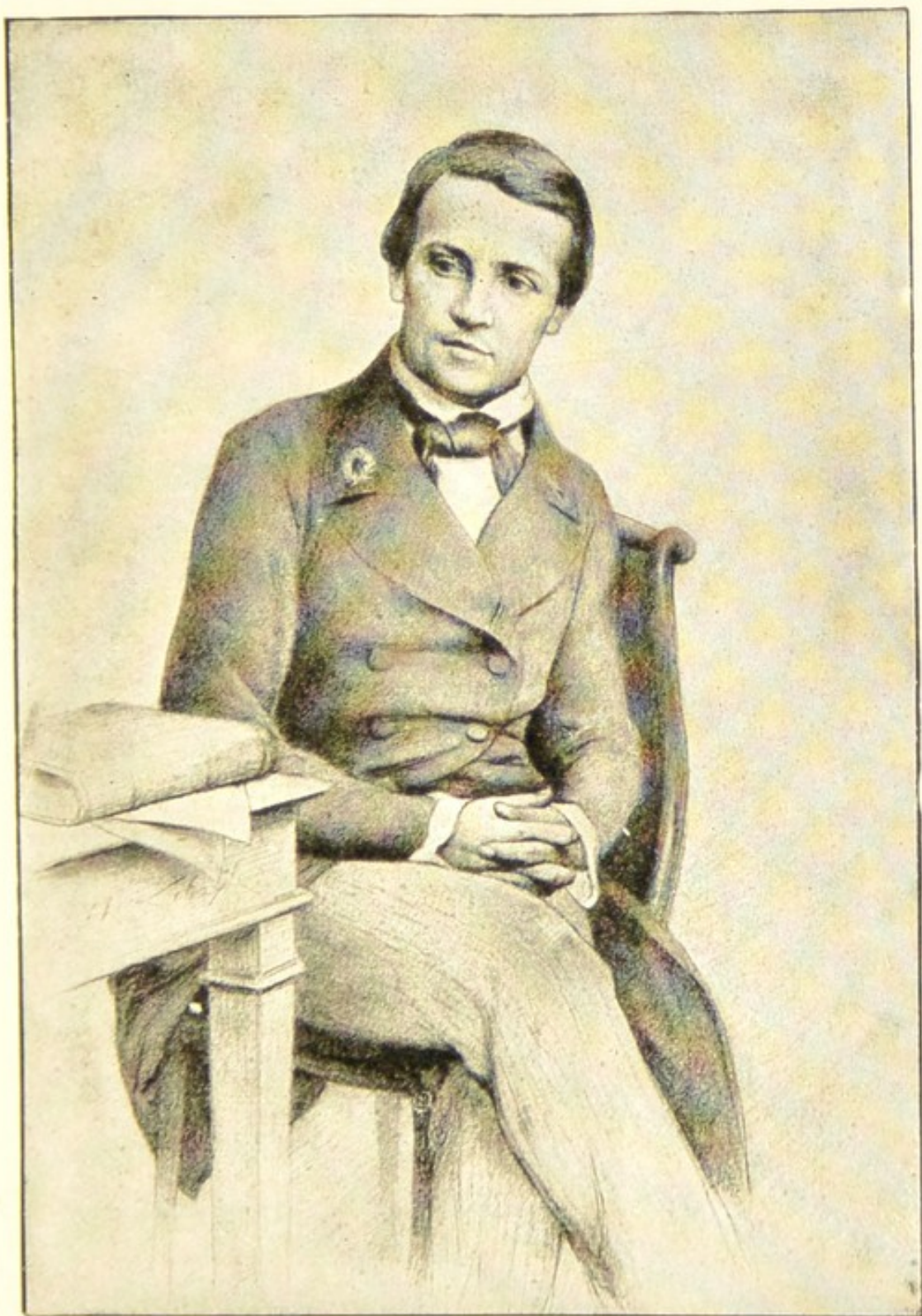
PASTEUR WHEN A STUDENT AT THE ECOLE NORMALE.