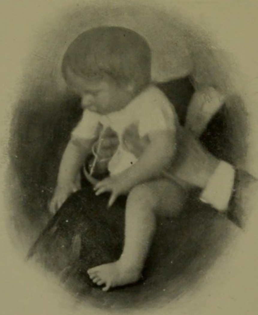
SHOWING SIMULTANEOUS MOVEMENT OF THE LITTLE FINGER AND THE LITTLE TOE ON THE SAME SIDE