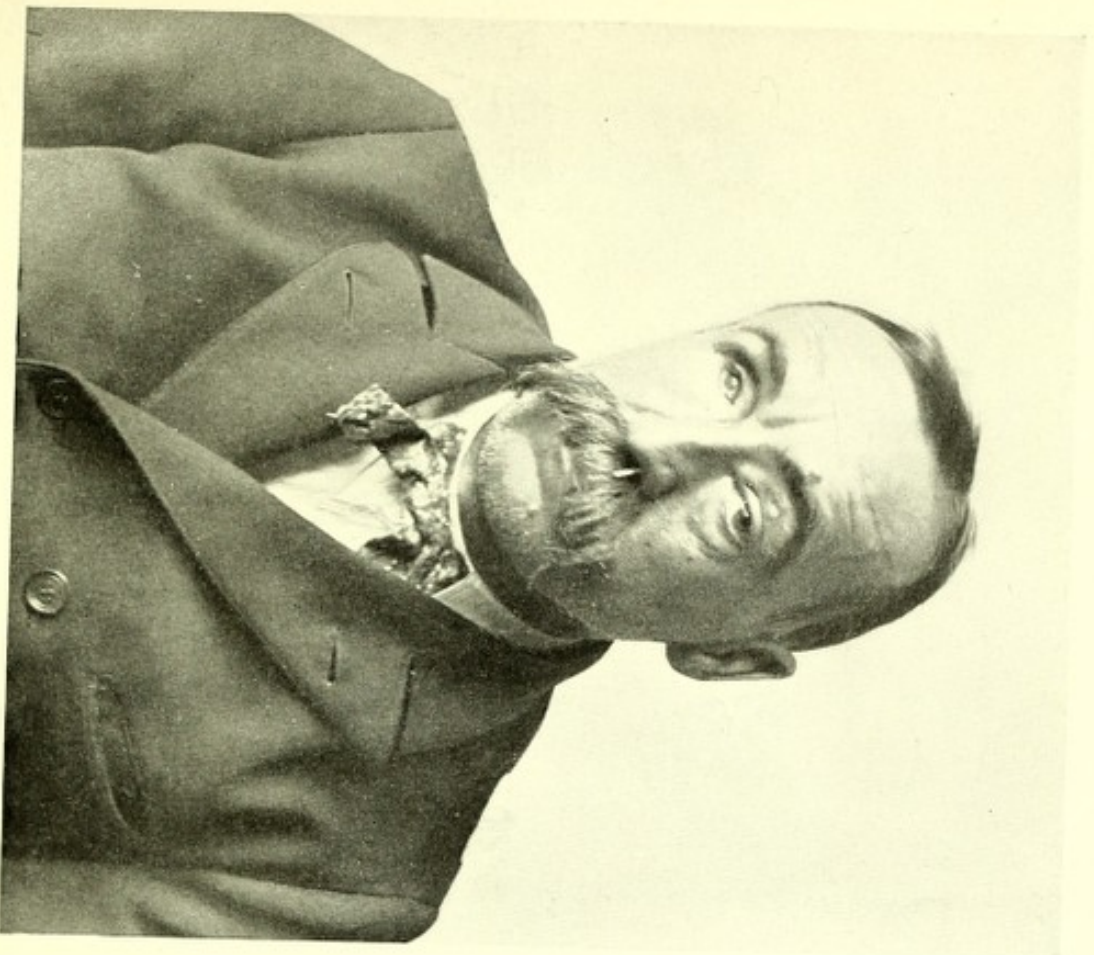
Fig. 1.—Shrunken right eye from injury and swelling above left eye.