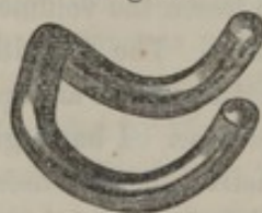
Dr. Hodge's Pessary.