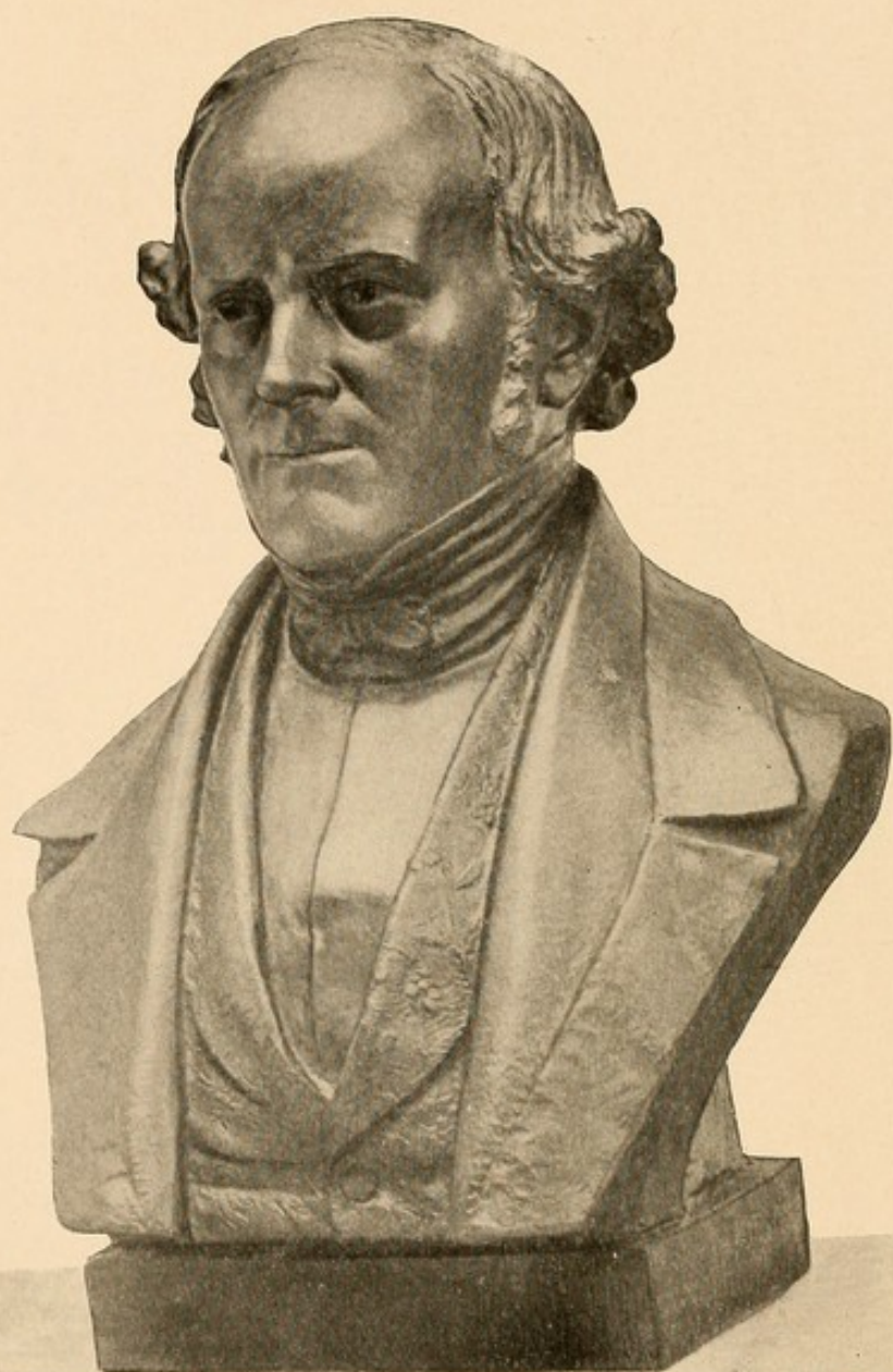
HORACE WELLS THE DISCOVERER OF ANÆSTHESIA. PRESENTED BY THE DENTISTS OF AMERICA.