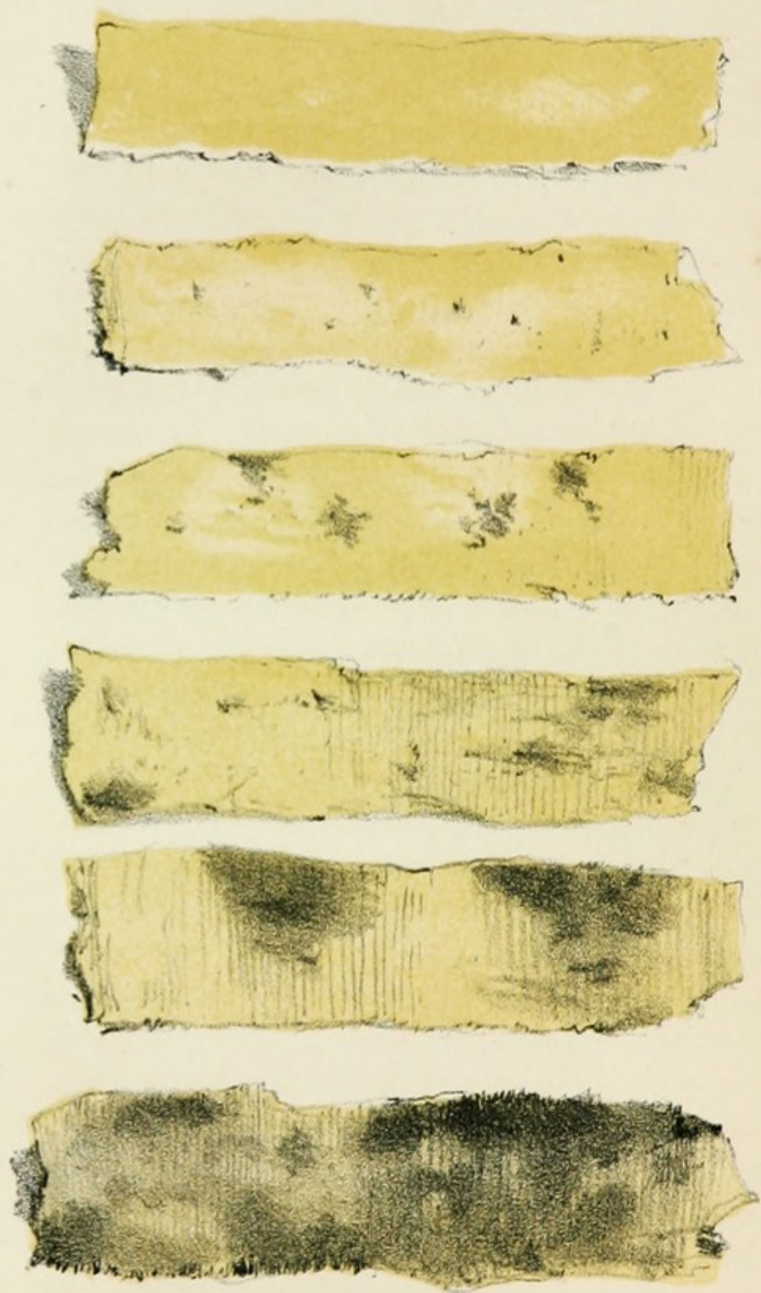
Specimens of bandages applied to Crises.