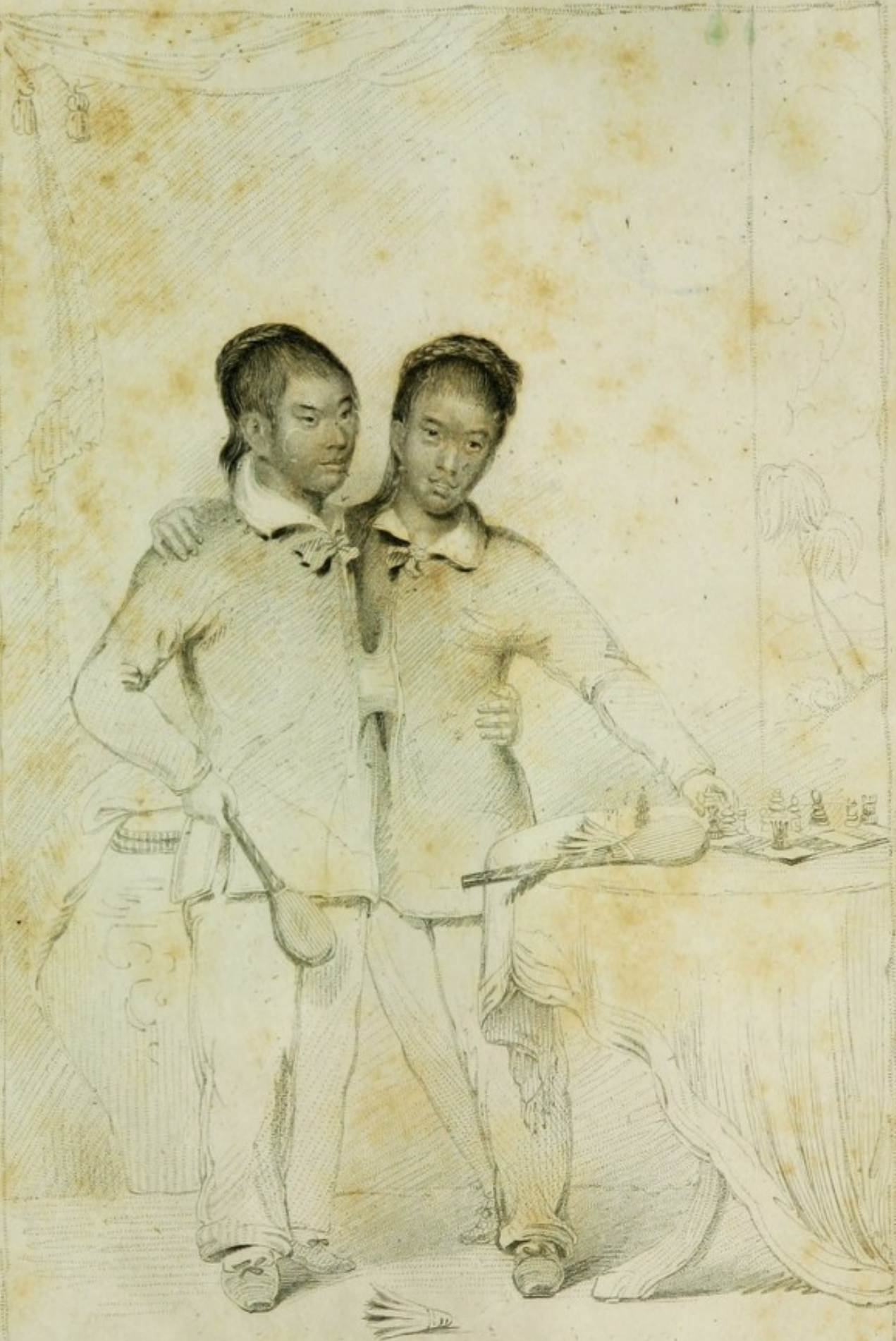
ENG and CHANG, THE CELEBRATED SIAMESE YOUTHS.

Published as the Act directs. Jan: 28. 1830