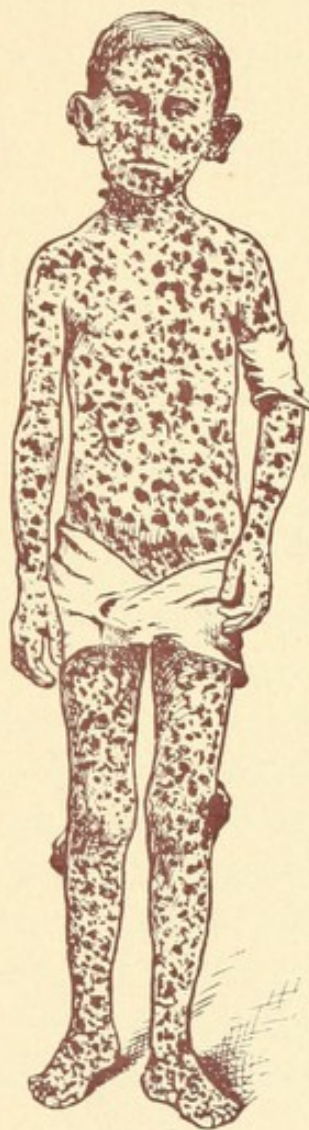
ECZEMA FROM VACCINATION.