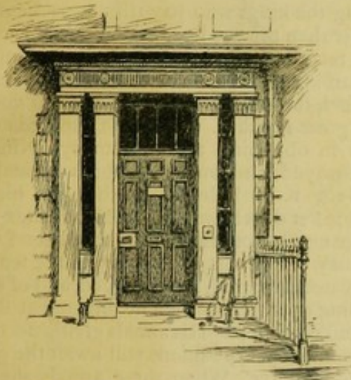
DOOR OF DR. SIMPSON'S HOUSE, 52 QUEEN STREET, WHERE THE EXPERIMENTS WERE TRIED.

"THE old order changeth, yielding place to new," and science nowadays presses so rapidly onward that chloroform, after deadening pain for nearly half a century, may soon be superseded by some newer discovery. Before that time comes, before those who can remember when there was no blessed anodyne to annul suffering, and before those who assisted at the introduction of chloroform, are gone from us, it may be of interest to look back and recall the circumstances of its first employment, in 1847, by my father, Professor James Y. Simpson. Of the few who were then assisting him in his experiments to discover the drug most potent for anesthetic purposes, there survive only two, and from them I have gleaned the recollections of that event here recorded.