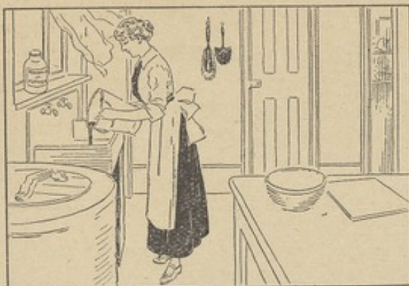
Disinfect the Drains and Sinks every day.

Full Moon 4d. 2A. 1m. Aft. 1st. Qtr. 12 5 48 Aft. New Moon 19 9 33 Aft. 2nd. Qtr. 26 0 3 Aft.