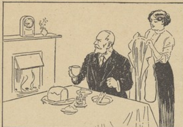
Don't Hurry your Meals.