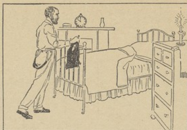
"Early to Bed and Early to Rise."