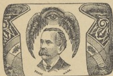
DOAN'S DINNER PILLS.

Unless this refuse is promptly disposed of, it is likely to get back into the circulation and to poison the whole system. It is the cause of liver complaint, biliousness, indigestion, diseases of the stomach, inflammation of the bowels, piles, skin diseases, and of later complications which often end fatally.