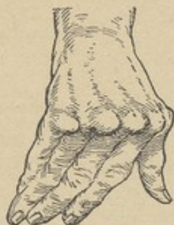
HAND DISTORTED BY URIC ACID DEPOSITS (From a photo.)

Patients should drink plenty of water to keep the uric acid in solution. Everything possible should be done to raise the general health of the body to a high standard by careful attention to diet, which should be nutritious and heat-producing, but digestible. Ale, stout, and spirits are not suitable. Wear flannel underclothing night and day, and sleep between the blankets. Turkish baths, hot baths, and massage are helpful. A change of air will often effect a cure, for some towns are more rheumatic than others, especially towns that lie low and get a lot of rain. Living in a damp house will make rheumatism much worse. Take every precaution against catching cold.