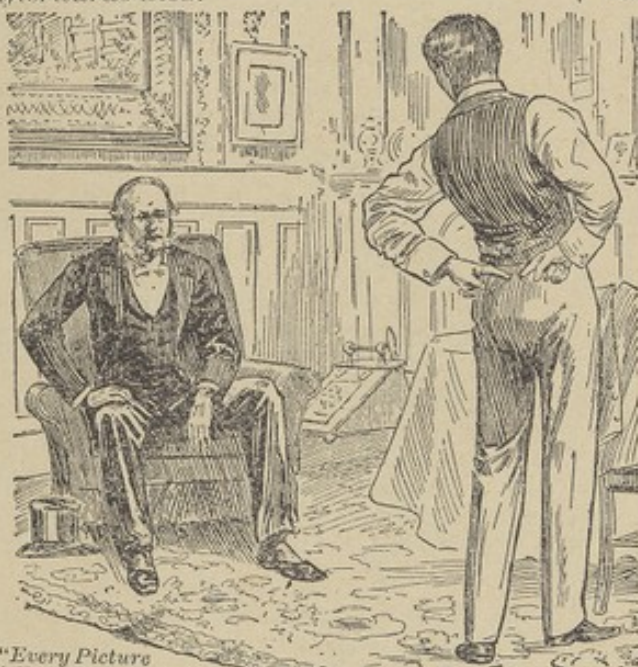
"Every Picture tells a Story."

The rabbit sickened at once, and shortly afterwards died.