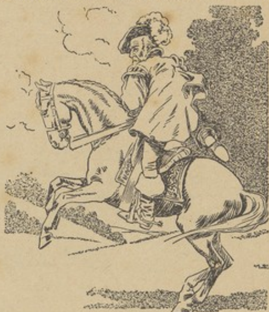
"I mount my horse without assistance."

These arguments made such an impression on me that, mortified as I was by the thought