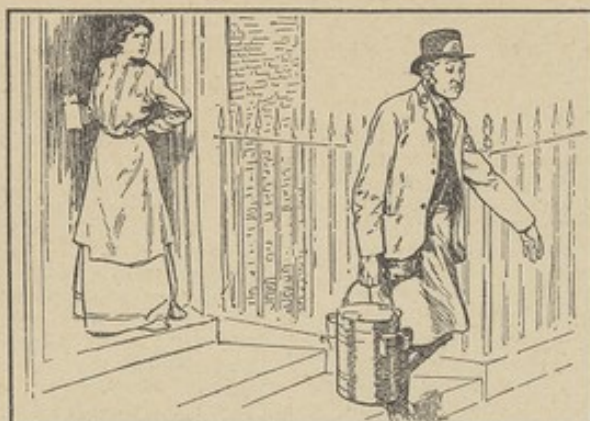
Don't Lose your Temper.

Fst. Qtr. 5d. 5A. 3m. Morn. Full Moon 12 4 19 Morn. Lat. Qtr. 18 7 39 Aft. New Moon 26 6 9 Aft.