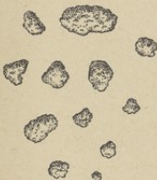
Some of the 30 stones removed by Doan's Pills. (Actual size—from a photo.)