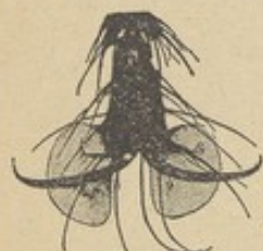
Webbed Foot of House-fly (greatly enlarged).

less looking house-fly is so formidable a foe to health that it has been described as “the most dangerous animal in the world.” Its webbed foot picks up hosts of disease germs from the vile refuse on which it pitches, and afterwards it enters the house and deposits these germs in the milk, upon the food, on the nipple of baby's bottle, or on the skin. So many mysterious infantile complaints and diseases—including consumption—are spread about in this