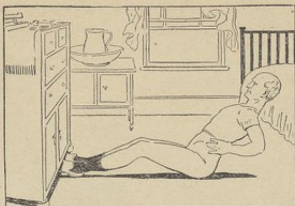
Take Regular Daily Exercise.

Full Moon 7d. 2A. 0m. Aft. Let. Qtr. 15 7 32 Morn. New Moon 23 2 38 Morn. Est. Qtr. 29 11 51 Aft.