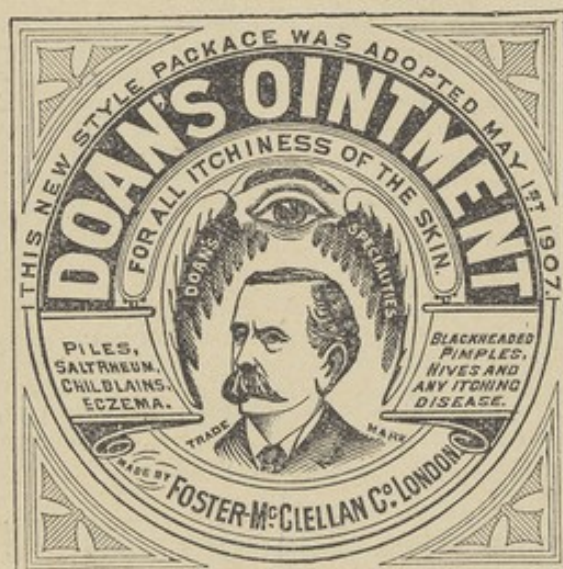
DOAN'S OINTMENT.—The Genuine Package.

long as the bowels are costive a permanent cure is impossible. For this purpose Doan's Dinner Pills (see page 31) are recommended with confidence, being purely vegetable and entirely free from calomel, or other harmful mineral poisons which form the active agent of the majority of violent purgatives. Patients should diet strictly on plain, wholesome food, and should get as much fresh air, rest, and sleep as possible.