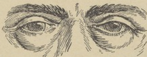
Watery Swellings under the Eyes and in the Ankles, Limbs, Hands, and Body indicate Dropsy.

It may show that the kidneys are failing to separate the urine from the blood, or that there is gravel obstructing the urinary canals and preventing the waste water passing out; or it may be