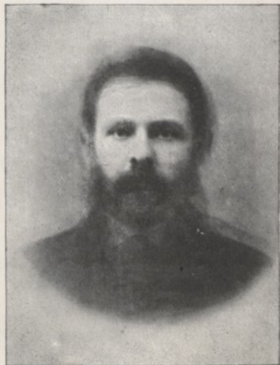
FIG. 4.—TWENTY-SIX FIELD-GEOLOGISTS, TOPOGRAPHERS, ETC.