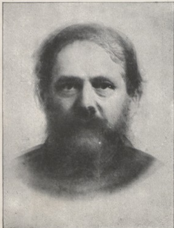
FIG. 3.—THIRTY-ONE ACADEMICIANS.