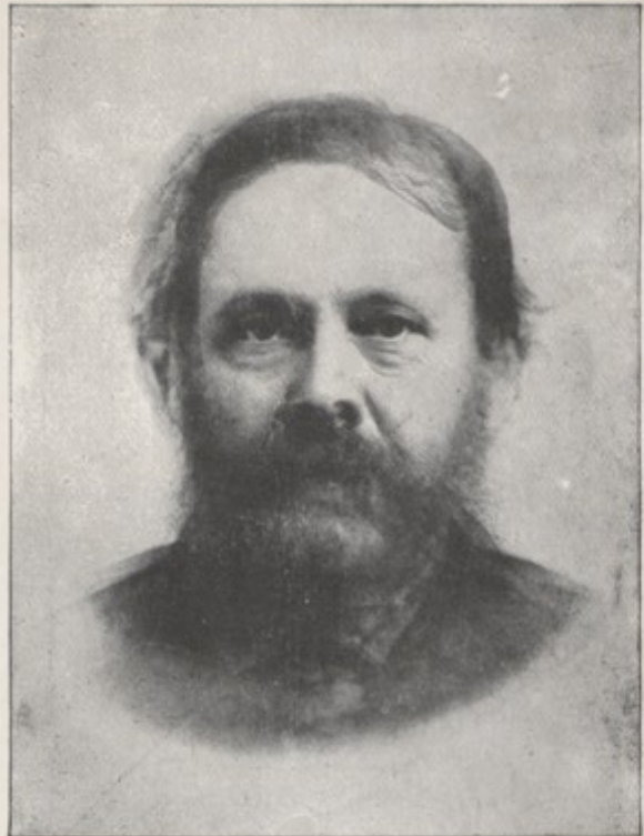
FIG. 2.—SIXTEEN NATURALISTS.