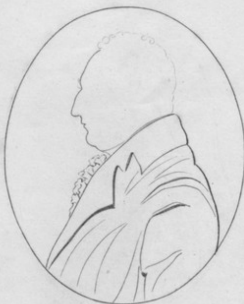
Samuel Galton d. 1832