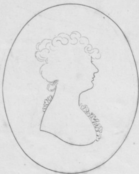
6:1784 Adela Booth (twin) Sister of Theodore