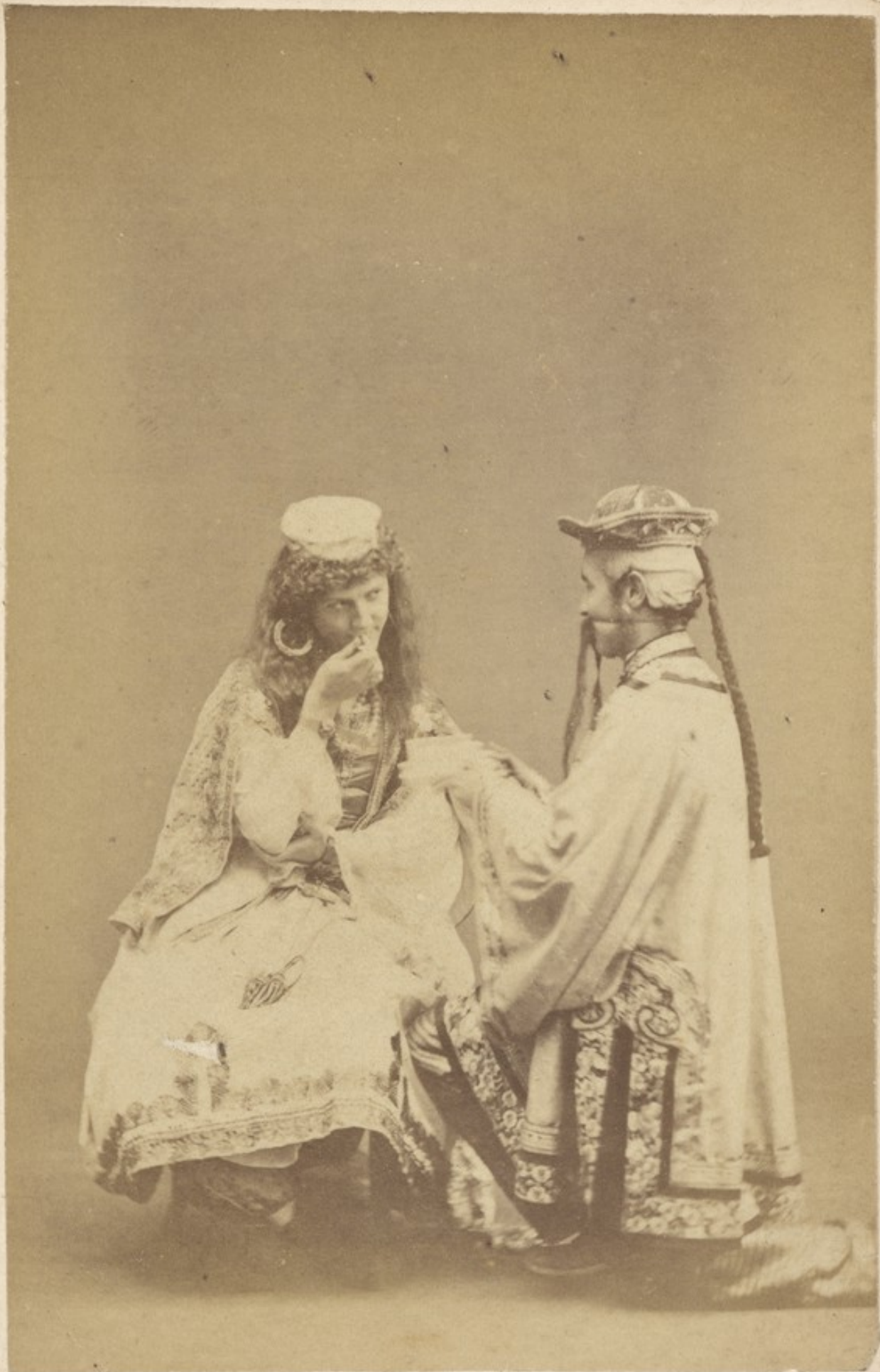
Sutton & Knight