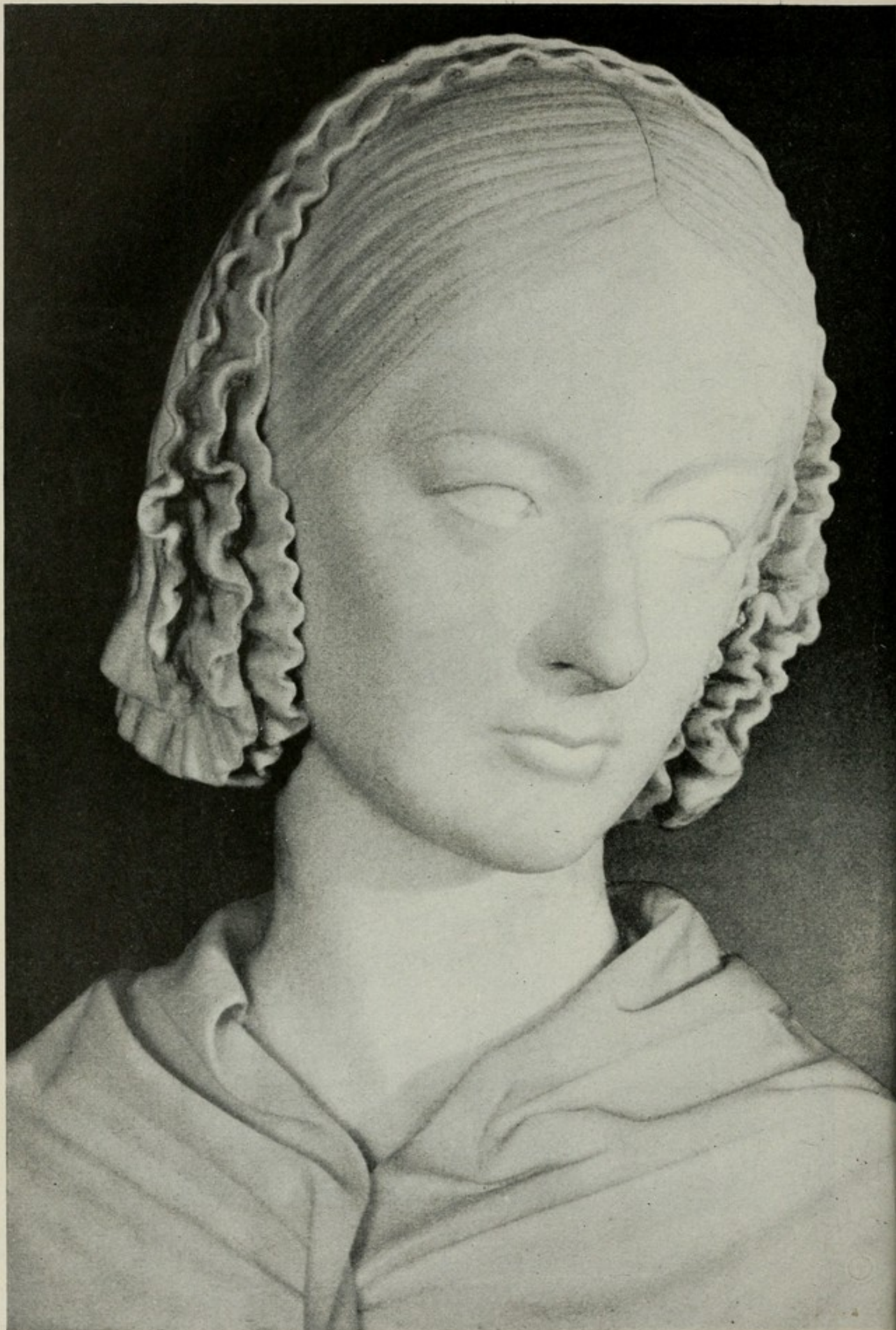
Miss Nightingale, 1859 From the bust by Sir John Steell